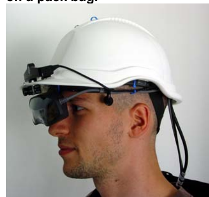
Fig. 7: Helmet worn by the user with a camera, orientation tracker and HMD.