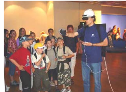
Fig. 1: Demonstration of the Augmented Classroom at a local high school science fair.

To enhance the classroom situation and for spectators not wearing an augmented reality kit, we provide an overhead projection that can also be used to view 3-dimensional content attached to markers. By moving a marker in front of the projection surface, its contents are shown on the projection.