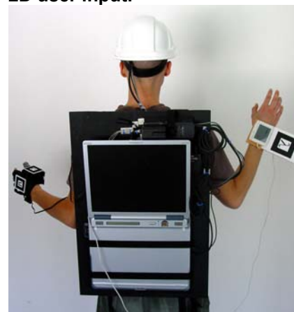
Fig. 6: Mobile setup mounted on a pack bag.