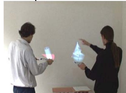
Fig. 4: Interacting with models in front of a projection screen.