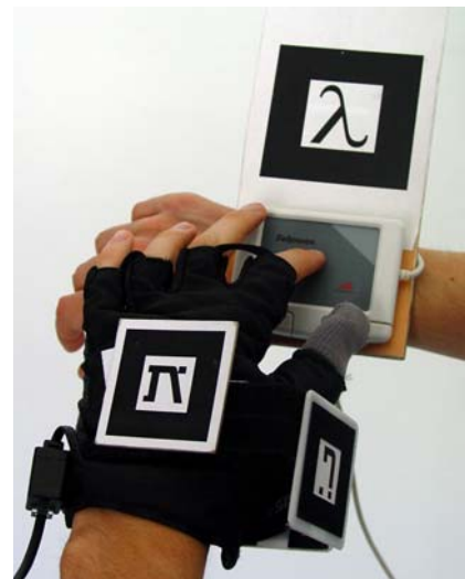
Fig. 5: Tracked pinch glove with pressure sensitive thumb for 3D direct manipulation and wrist mounted touch pad for 2D user input.