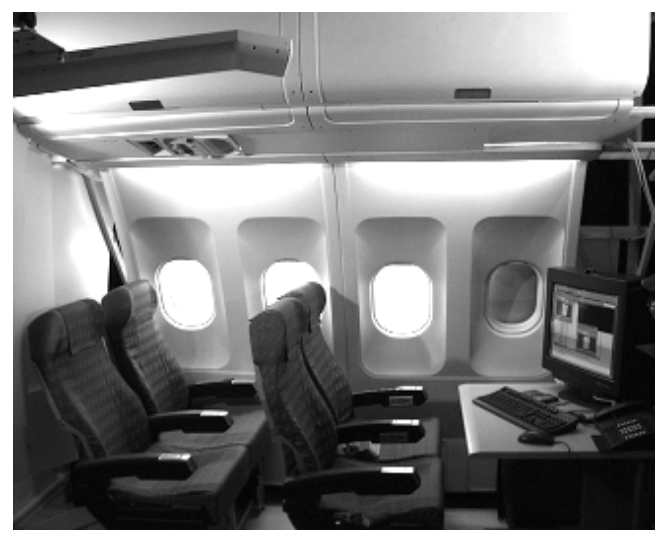
Figure 2: Real cabin environment in stationary setup

All data sets (CFD, VR, phantom) are pre-computed / - modeled. Because of missing hardware look-up-tables on the PC-based graphics boards unfortunately no interaction with the CFD data is possible, except for the self-movement around and thru the data.